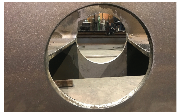
With SteelPRO and Güdel, one machine can make five or six holes in 15 minutes.

software — and other software improvements, Inovatech's Async control software program is 40 percent faster today than it was during its introduction just a few years ago. And while that's significant, the benefits of using an automated cutting table made of today's finest automation components translates to 400 percent more productivity for Inovatech's customers.